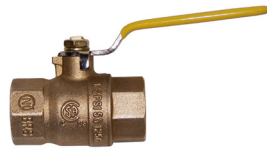
Full Port Shutoff Valve