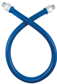
Blue Hose ® Food Truck Gas Connector