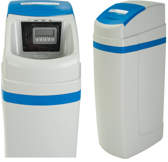
PWSCAB Series Softener