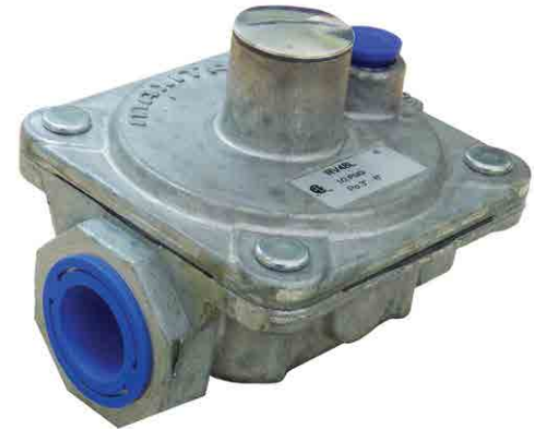
R48N32 and 42-0306-3.5 (1/2 PSIG Gas System)

Gas appliance regulators are designed for main burner and/or pilot applications, where precise control of tiny flows is an essential operating requirement. Housings are high strength aluminum castings and all models have been tested for multi-position and may be installed in any plane or angle without restriction.