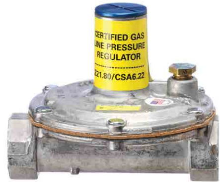
R325P32-0711-11_R625P42-0711-11 (2 PSIG Gas System)

Line pressure regulators for 2 psi piping systems for use on residential, commercial and industrial applications. Features a high leverage linkage assembly to deliver positive dead-end lock-up. The regulators are capable of precise regulating control from full flow down to pilot flow. Housings are high strength aluminum castings and all models are suitable for multi-positional mounting. If ball check vent limiting device is installed, mount in an upright position only.