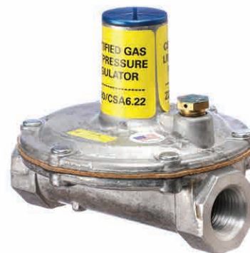
R325N32-0509-06 (2 PSIG Gas System)

Gas appliance pressure regulators for 2 psi piping systems for use on residential, commercial and industrial applications. Features a high leverage linkage assembly to deliver positive dead-end lock-up. The regulators are capable of precise regulating control from full flow down to pilot flow. Housings are high strength aluminum castings and all models are suitable for multi-positional mounting. If ball check vent limiting device is installed, mount in an upright position only.