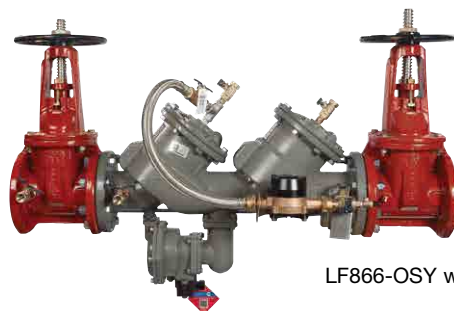
LF866-OSY with flood sensor