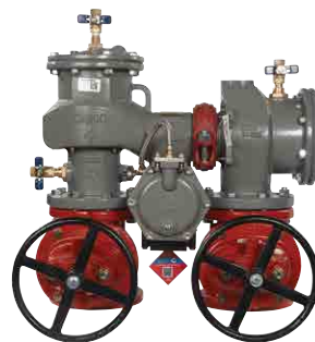
LF880V-NRS with flood sensor