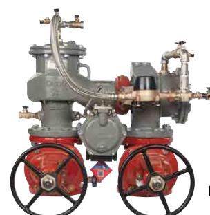
LF886V-OSY with flood sensor