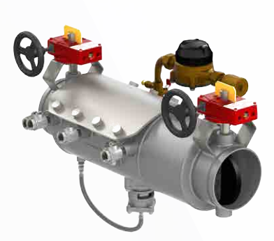
Deringer 50X — 6 inch