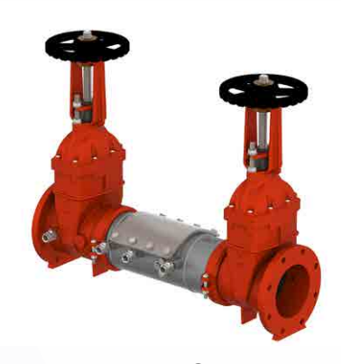
Deringer 20G - 8 inch