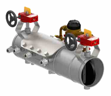
Deringer 30 - 8 inch