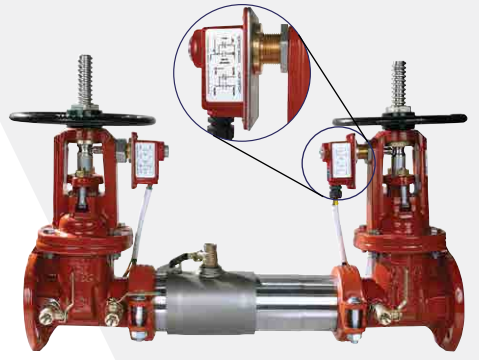
C200-OSY with supervisory switches