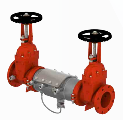
Deringer 40GX — 6 inch