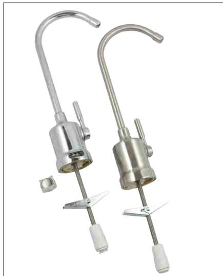
Two Faucet Types Monitor and Standard