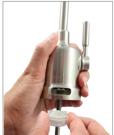
Faucet with battery operated Filter change monitor