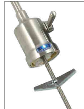
Models with monitors are available.