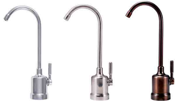
Top mount faucets available in chrome, brush nickel and oil rubbed bronze.