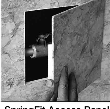
SpringFit Access Panel