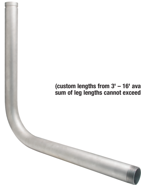
(custom lengths from 3' - 16' available - sum of leg lengths cannot exceed 19')

Transition Riser shall be installed as indicated on the plans. Riser shall be composed of a single extended 90 degree fitting of fabricated 304 stainless steel pipe, maximum working pressure 200psi (14 bar). The fitting shall either have a grooved end, flanged, or MNPT or FNPT connection on the outlet (building) or inlet (underground) side. The Transition Riser shall be a Watts Series TR2.