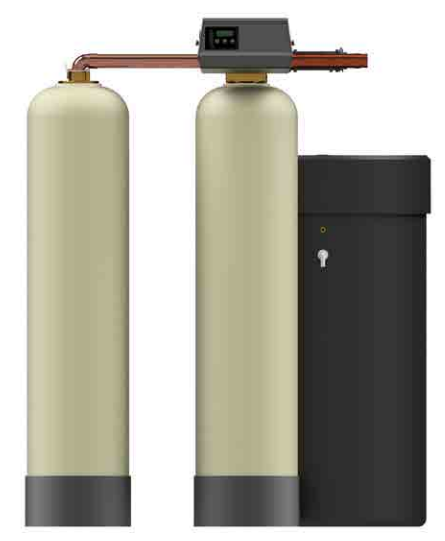
Series LCTA-150 Twin Alternating